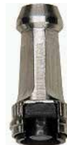
ERA RV Impression Coping 811232