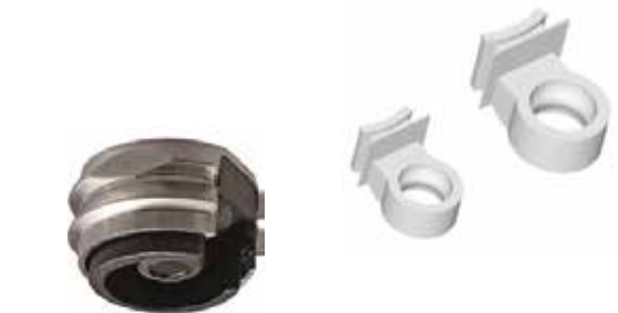
ERA-RV Metal Jacket - Partial 811168