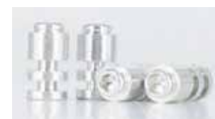
8516 - LOCATOR FEMALE ANALOG 5MM WIDE PLATFORM