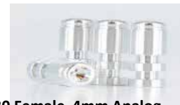
8530 Female 4mm Analog