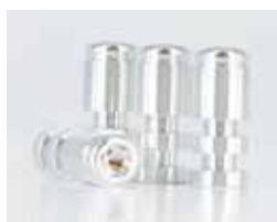
8530 - LOCATOR FEMALE ANALOG 4MM NARROW AND REGULAR PLATFORM