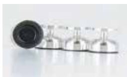
8505 - LOCATOR IMPRESSION COPING

Includes: Titanium Denture Cap with Black Processing Male, Red Male (0.5-1.0lbs), Orange Male (2.0lbs), Green Retention Male (3.5-4.0lbs), and Block-Out Spacer.