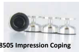
8505 Impression Coping